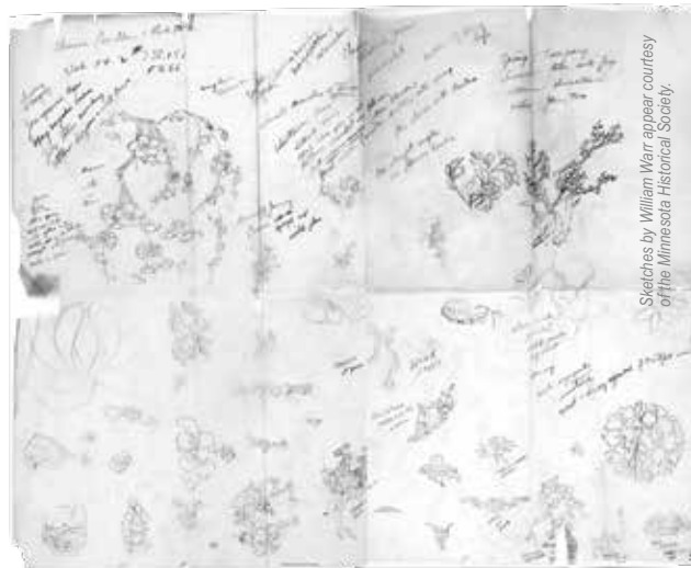
Sketches by William Warr appear courtesy of the Minnesota Historical Society.