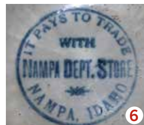
Photo courtesy of Kansas & Missouri Advertising Stoneware from Red Wing, Minnesota, pg. 45.