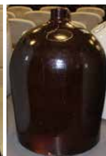
This mint 5 gal Albany slip jug back-stamped Red Wing was a steal at $375.