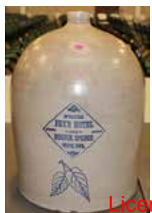
This 5 gal Birch Leaf beehive jug with adv. from Colfax, IA had a few chips and a possible hairline, but was still a great buy at $625. The dark glaze likely played a role in the low price.