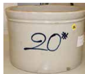
This RW 20 lb. butter crock had a math equation scratched on the side, under the glaze. Despite a chip and crowfoot, it drew a strong sale price of $825.