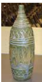
Decorator Line M3016 vase (mint), $425.