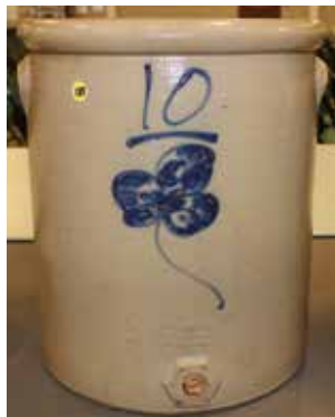
10 gallon Red Wing front-stamped straight-sided salt glaze water cooler (hairline), $4,600.