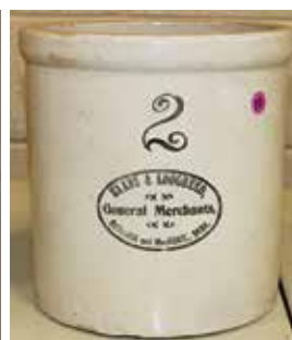
2 gal Red Wing crock with adv. from Outlook & MacRorie, Sask. (chips), $975.