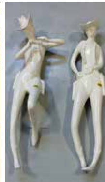
Pair of 24" Red Wing Cowboy figures (one small chip), $3,100.