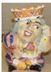
Red Wing "King of Tarts" cookie jar (mint), $325.