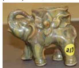
This cute 3 1/2" Nokomis Elephant sold for $625. A 6 1/2" Nokomis Elephant brought $400 (both mint).