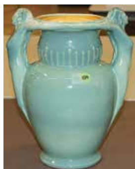
#249 Light Green Nude vase (hairline), $325.