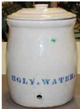
3 gallon Red Wing "Holy Water" stenciled water cooler (hairline) and lid, $4,100.