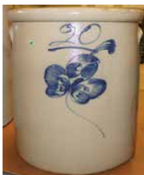
Unsigned 20 gal Red Wing butterfly crock (mint), $1,150.