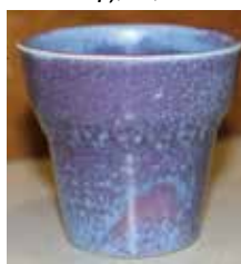
2 1/4" mini Red Wing flower pot in Hyacinth glaze (mint), $500.