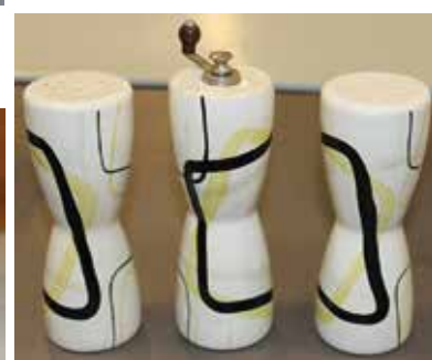
Rare Red Wing Smart Set Pepper Mill (center) with salt & pepper shakers (each mint), $800.