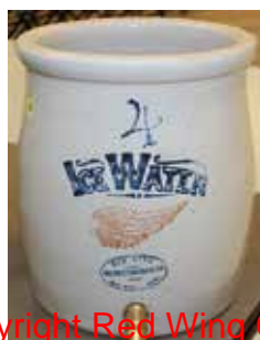
Attractive 4 gal RW Ice Water cooler (crows-foot), $450.