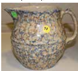
RW sponge pitcher with Hull, Iowa adv. (small painted-over spout chip), $950.