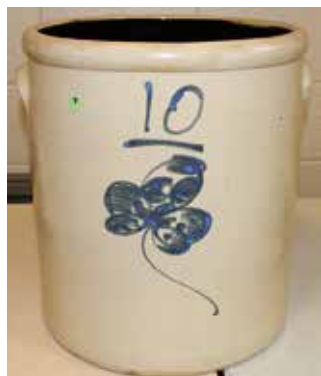
10 gallon transition butterfly crock (faint hairlines), $3,800.

Above: Potters Excursion jugs always bring good money when offered for sale, and this one was no exception. Accompanied by a letter about the history of the area family that it had belonged to, the mint jug sold for $6,200 – the top lot in the 2017 RWCS Convention Auction.