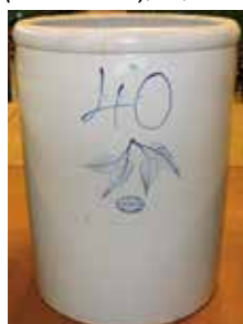
40 gal Birch Leaf crock (two small chips), $1,200.