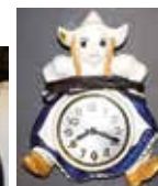
Mursen "Gretel" clock, $75 & RW mini jug, $400.