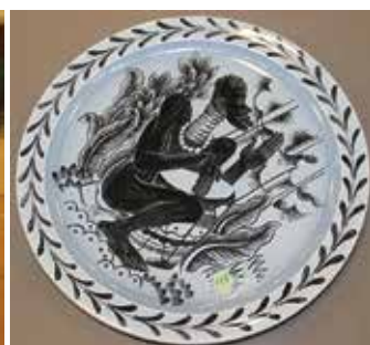
14" Charles Murphy "Congo" plate w/ drummer, $650. A yellow plate with the same decoration brought $550.