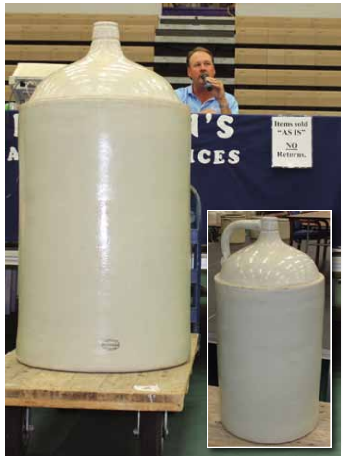
Only the second 70 gallon jug known to exist, this massive piece took top honors at the 2014 RWCS Convention Auction. Although restored, it sold for $17,000. It has a 6-foot 5-inch circumference and measures a whopping 4 feet tall, which is actually 1 inch taller than the 70 gallon jug that the Schleich Family donated to the Pottery Museum.