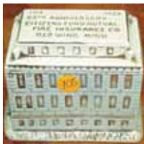
This hard-to-find advertising piece made in 1939 to commemorate the 25th anniversary of Citizen's Fund Mutual Fire Insurance Co. sold for $375.