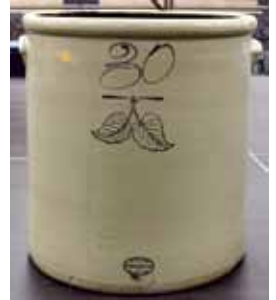
There were two 30 gal Elephant Ear transition crocks in the sale; the one above (mint) sold for $1,150 and a damaged one sold for $450.

This "Minne-ha-ha Brand" adv. crock was bottom-signed. It hammered down at a respectable $1,900 bid.