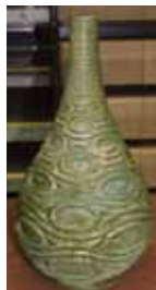
Standing 20" tall, this M3016 Decorator Line vase (mint) was a good buy at $400.