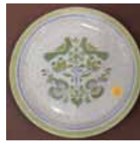
A test plate with green and blue Turtle Dove pattern on a beige fleck Hotel & Restaurant plate sold for $340. Glaze codes "315-238-400" were on the back.