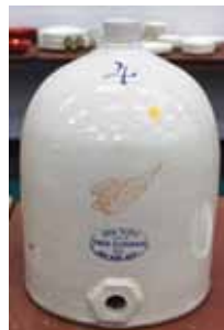
This killer 4 gallon wing beehive threshing jug with "Ski" oval (flake & chip) sold for $1,200.