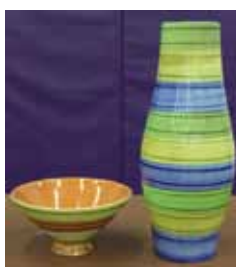
Chromoline prices remain strong! From left to right: #682 vase (mint), $450; #675 bowl (chip), $100; #687 vase (mint), $650.