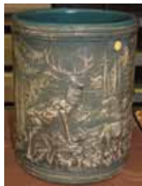
Bottom-signed with the Red Wing Union Stoneware ink stamp, this #107 Stag Sand Jar had an outer rim chip and sold for $450.