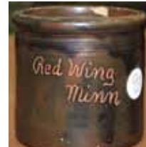
Measuring only 3.25" tall, the lunch hour piece (chips) above with "Red Wing, Minn." on one side and "Ellen" on the other sold for $1,050.